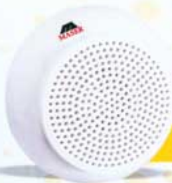
MASER ULTRASONIC RODENT REPELLER STANDARD, TM I & TM II MODEL

Connect the wires of the new top to the wires from the controller and screw them in position as shown in figure 2 and press fit the top to the base.